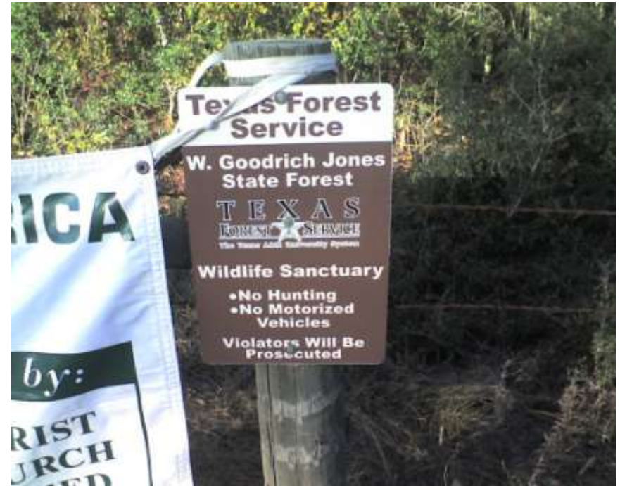
Entrance to Camp Dimora