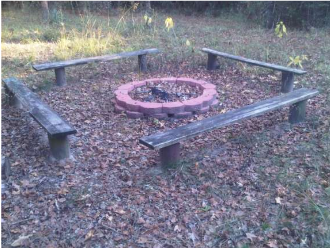
Camp Dimora – Great Campfire Ring!